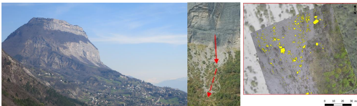
Fig. 1 The Mont Saint-Eynard limestone cliff (left); the 1500 m 3 rockfall (middle); orthophoto of some blocks of the 1500 m 3 rockfall.(right).

A methodology for impact frequency assessment is applied to the Mont Saint-Eynard cliffs, which overhang the Grenoble urban area (Fig. 1). The lower cliff is 240m high, separated from the 120 m high upper cliff by a ledge covered with forest. The upper cliff consists of massive limestone (bed thickness >1 m) while the lower cliff consists of fractured thin bedded (10–50 cm) limestone. The bedding planes dip inside the cliff. This anaclinal configuration, completed by subvertical fractures, produces overhanging compartments falling mainly by toppling.