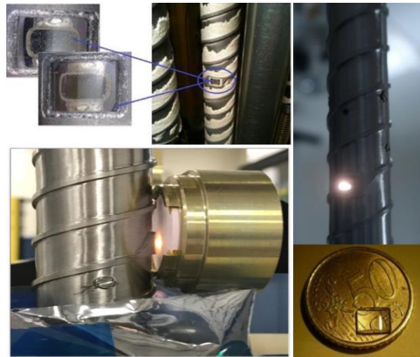
Fig.1: Ma_MISS Shapphire Window during drilling tests; illuminated by the lamp; with the rover observing spectral sample and in comparison with a coin.

By combining a number of column and ring observations, Ma_MISS allows the reconstruction of a fairly complete image of the borehole wall.