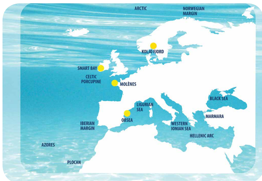
Figure 1. Map of current EMSO nodes. Yellow dots indicate testbeds.

Turkey, Germany, and the Netherlands. Participation is open to all (both individual scientists and institutions), and will be coordinated through an association called ESONET-Vi (European Seafloor Observatory Network—The Vision), following the extensive scientific community planning