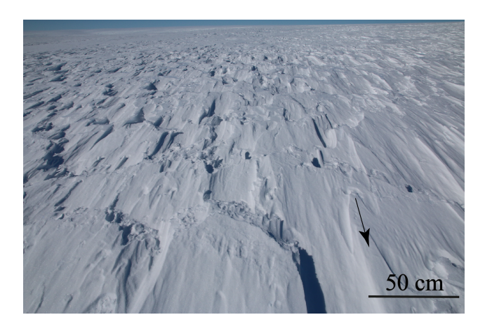
Figure 2. Photograph of the snow surface at D17 in January 2014. The arrow indicates the mean direction of the wind episode that led to the formation of the sastrugi.

arithmically spaced intervals between 0.8 and 7 m above the snow surface using Vector A100LK cup anemometers and HMP45A thermo-hygrometers installed in naturally ventilated MET21 radiation shields. The anemometers are mounted on roughly 1 m long booms pointing southeastward. Wind direction is only sampled at the upper level by a Vector W200P wind vane. Surface level variations are measured by a Campbell SR50A acoustic depth gauge. Information on drifting snow is obtained from a secondgeneration acoustic FlowCapt<sup>TM</sup> device that was set up vertically close to the ground to allow detection of the beginning of aeolian snow transport events. The sensor is a 1 m long tube that converts the acoustic pressure caused by snow particles impacting the tube into an aeolian snow mass flux integrated over the length of the tube. The second-generation FlowCapt<sup>TM</sup> was evaluated in the French Alps by Trouvil-