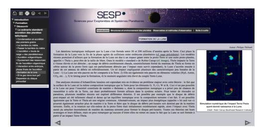
Figure 1: home page of the site SESP [3]

for the study of the object. Test : self-assessment exercises, to check that the chapters are understood and known. - Mini-project : a data analysis project with scientific data about solar system planets or exoplanets.