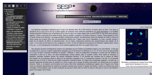
Figure 1: home page of the site SESP [3]

for the study of the object. Test : self-assessment exercises, to check that the chapters are understood and known. - Mini-project : a data analysis project with scientific data about solar system planets or exoplanets.