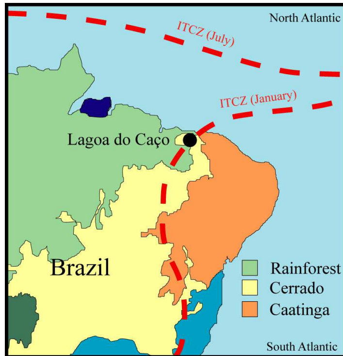
Figure 1: Location of Lagoa do Caço, present day position of the ITCZ during austral summer (January) and winter (July) and main ecosystems encountered in north-eastern Brazil.

The local present-day climate is tropical humid with pronounced seasonality. Precipitation, which annually reaches 1750mm on average, mostly occurs during the rainy season, from November to May. The mean annual temperature is 26°C. The vegetation in the watershed pertains to a large cerrado (shrub savannah) corridor inserted between the dry caatinga (savannah) ecosystem to the east and the rainforest to the west. Lagoa do Caço is therefore in a sensible position to track changes in vegetation distribution related to climate variations. Furthermore, this lake is located where the InterTropical Convergence Zone (ITCZ), that is the major control on precipitation distribution, presently enters the continent and shifts from its winter to summer position. The lake (ca. 2.5 km 2 surface area) occupies a former river valley within a dune field dating back to Pleistocene times. The maximum water depth is 10m during the wet season (austral summer) and 9m during the dry season (austral winter). The organic matter preserved in the sediments is mainly terrestrial in origin as attested both by bulk and molecular analyses (Jacob, 2003; Jacob et al., 2004a; Jacob et al. 2004b; Jacob et al., submitted).