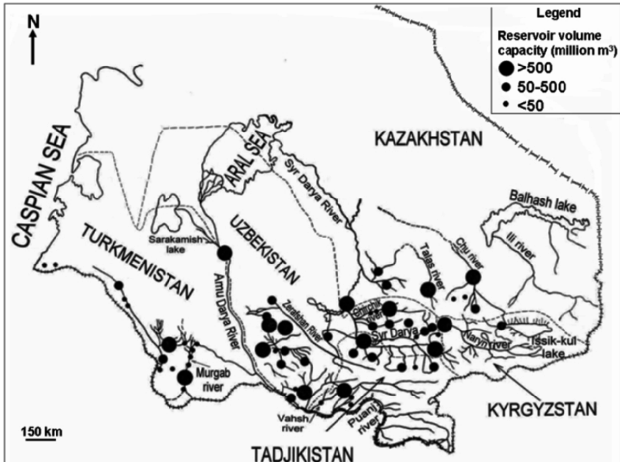
Figure 1. Schematic location of main water reservoirs and their volume capacities in Central Asia (excluding reservoirs in central and northern region of Kazakhstan).

The era of massive water reservoir construction was documented in the late 1900s. From 1950 to 1980) more than 60 large reservoirs have been constructed in the region (Figure 2). The gross reservoir volume has increased by 50 folds from 0.17 to 49.3km 3 as a part of unprecedented increase of water storage capacities around the globe. Most of the dams and water reservoirs in the region have been constructed for irrigation purposes with a few for hydropower generation. As a result over a period of 90 years (1913-2003) the areas under irrigation have increased by 3 fold in Central Asia, e.g. from 4.51 million ha in 1960 to 6.92 million ha in 1980 and to 7.85 million ha in 2000 [13; 25]. The peak of dam construction is dated to the soviet period when its policy was aiming at expanding irrigated lands for the mass production of cotton.